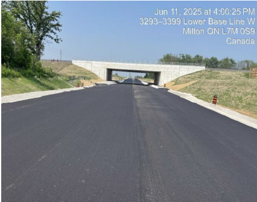
Figure 2.1.2 – July 11, 2025

Completion of asphalt paving at Lower Base Line bridge.