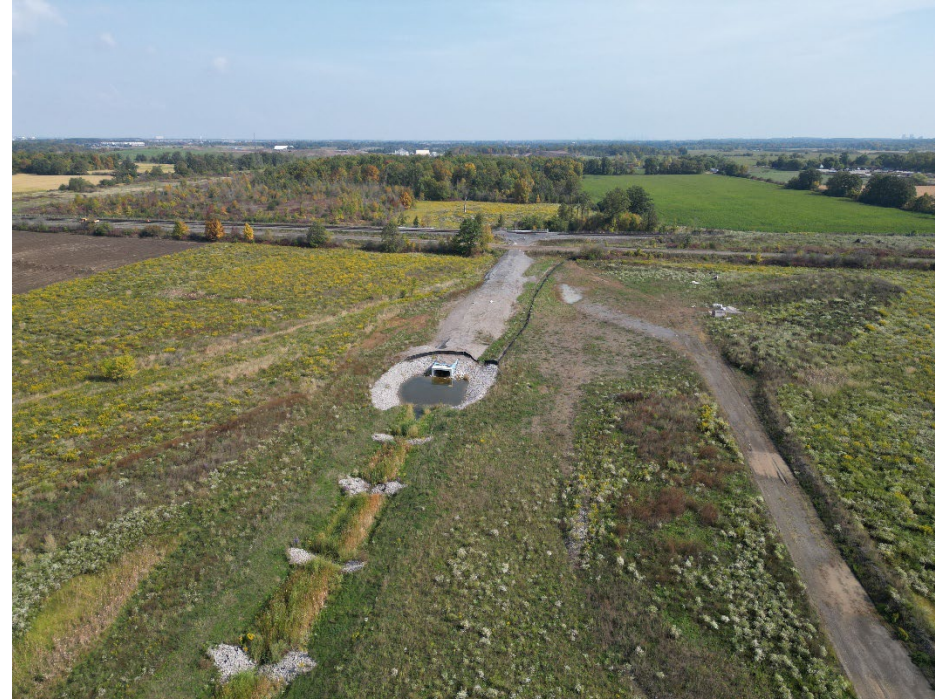
Figure 2.1.12 – September 23, 2025

Vegetation growth progress in Culvert 2 area.