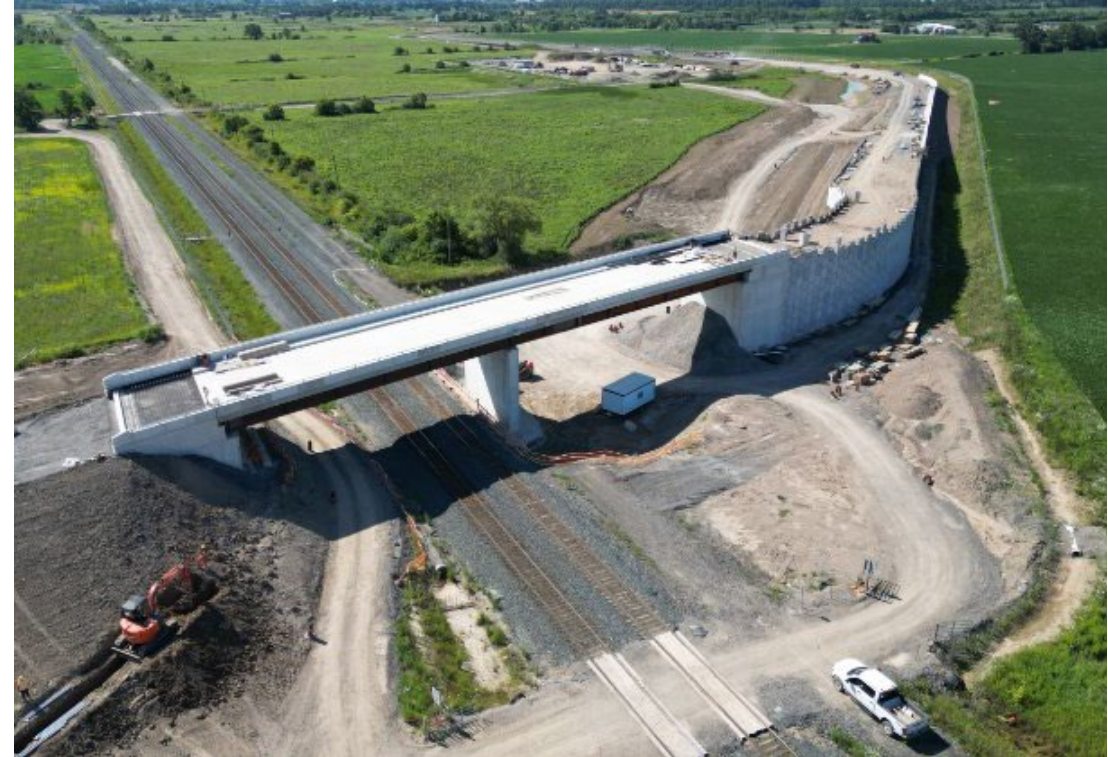
Figure 2.1.6 – July 17, 2025

Ongoing work on truck access via the Britannia Access Road Bridge.