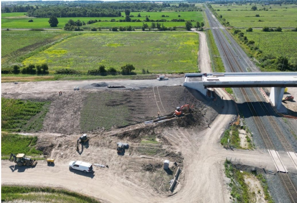
Figure 2.1.7 – July 23, 2025

Ongoing approach grading work to the Britannia Access Road and Bridge.