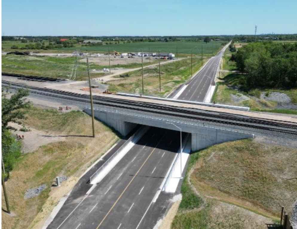
Figure 2.1.5 – June 23, 2025

Lower Base Line bridge roadway opened July 14, 2025, view looking northeast.