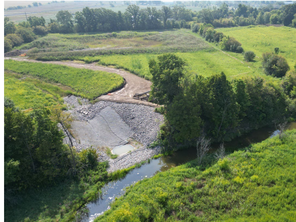
Figure 2.1.8 – August 14, 2025

Repaired regional diversion outfall after installation of new Flexamat and riprap.