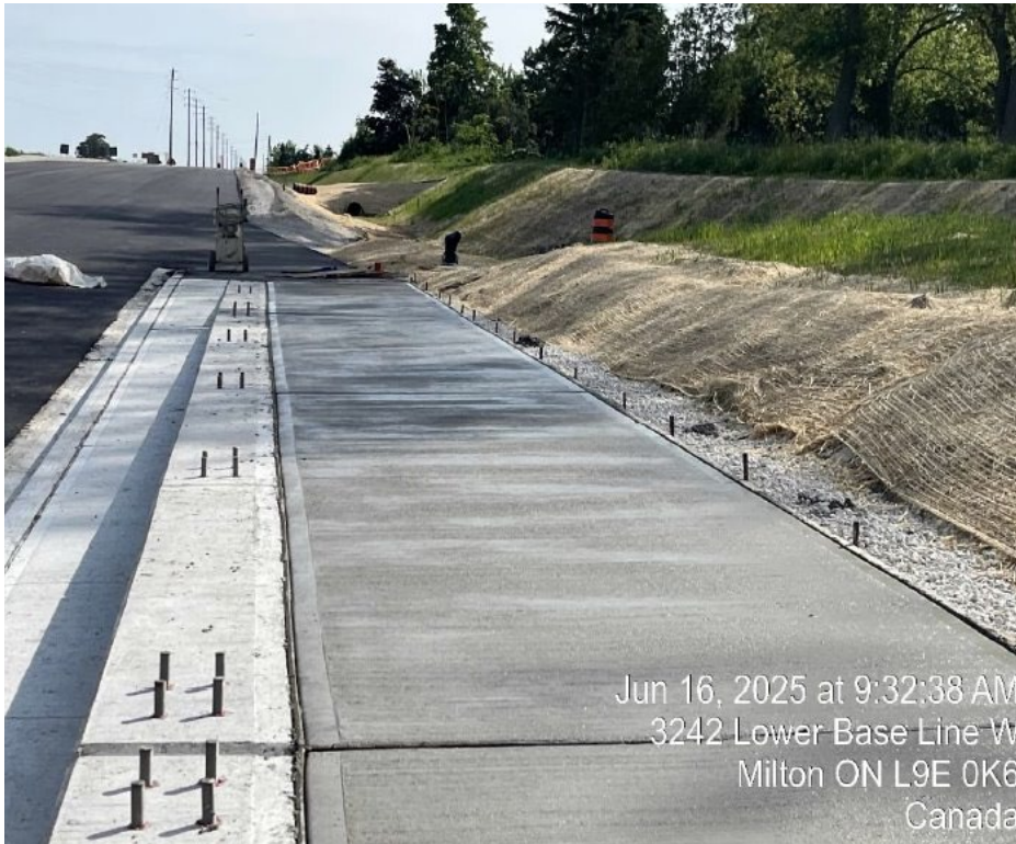
Figure 2.1.3 – June 16, 2025

Subgrade works for the mainline track extension at Derry Road.