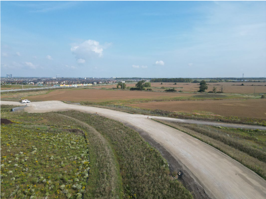
Figure 2.1.10 – August 21, 2025

Ongoing work on the new truck access. Grading and compacting the recycled materials.