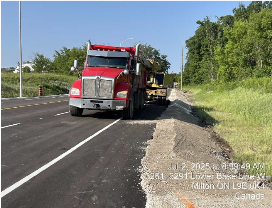
Figure 2.1.1 – July 2, 2025

Grading and shoulder shaping on the west side of Lower Base Line bridge.