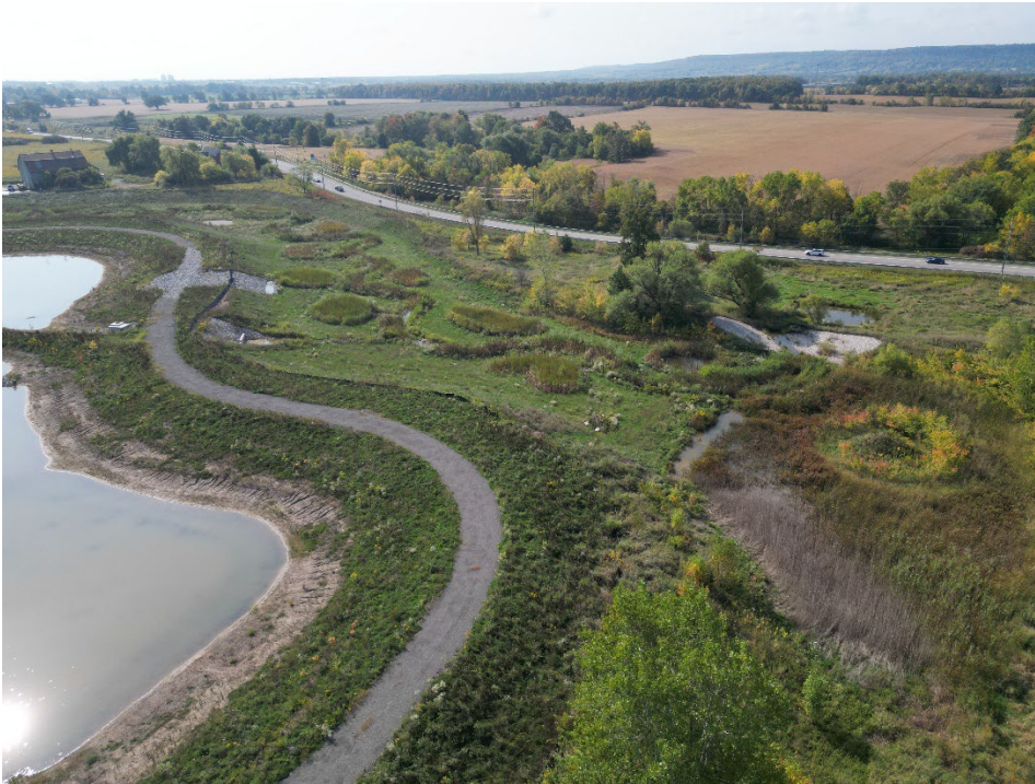
Figure 2.1.13 – September 23, 2025

Vegetation growth progress in Tributary A.