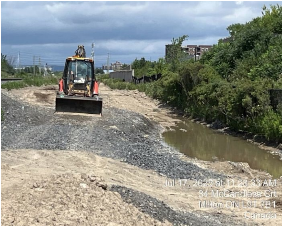
Figure 2.1.4 – July 17, 2025

Subgrade works for the mainline track extension at Derry Road.