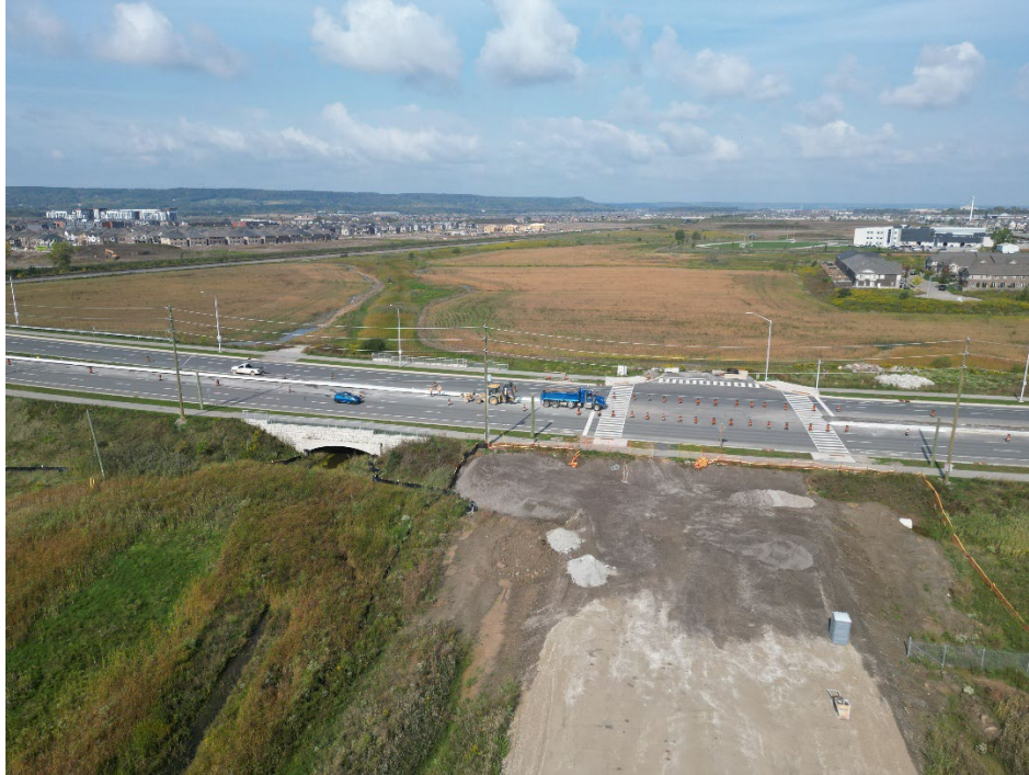
Figure 2.1.11 – August 29, 2025

Truck access right-turn lane grading work in progress from eastbound Britannia Road.